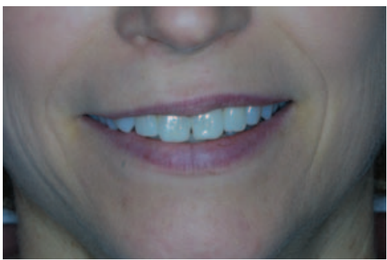
Bleaching is often the gateway to other restorative treatment needs.