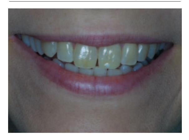
Figure 9: After bleaching, the patient is now interested in closing the diastema for a more attractive smile.