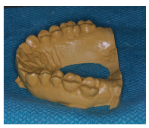
Figure 2: A non-scalloped, no reservoir tray in the mouth extends I-2 mm onto the gingival for a seal, but does not engage an undercut, encroach on a frenum, or end on a rugae.